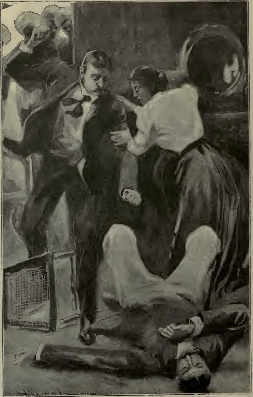
KNOCKED HIM DOWN